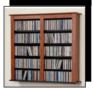
DVD Lending Ministry Starter Kit