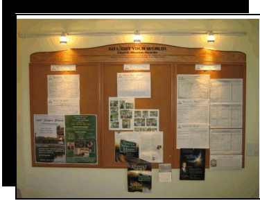
Church Mission Boards Outreach/Bible Studies/In-Reach