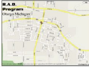
RAD (Road ADOption) Program!

A Three Part Exciting Program to Jump-start Your Church into Better Fulfilling the Great Commission!